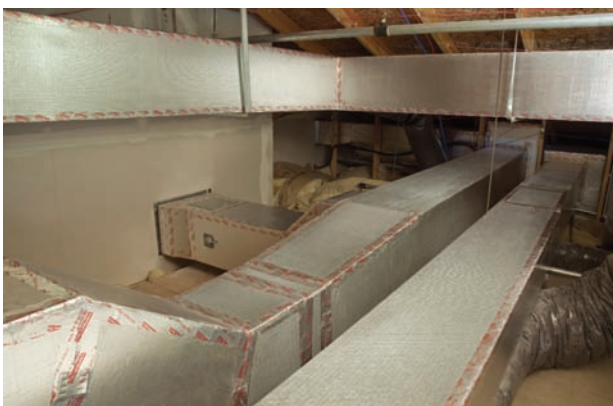
Figure 4: Cottage 6A, Kingspan KoolDuct ® System Ductwork Installation

Air leakage testing of both installations was performed by an independent testing, adjusting and balancing (TAB) contractor, certified by the Associated Air Balance Council (AABC). In order to provide a more accurate reflection of the actual volume of air leakage, including that from the accessories connected to the ductwork, the testing was carried out on the entire ductwork run (as opposed to the standard industry practice of testing a sectioned off portion), from furnace discharge to registers, using new, certified Oriflow testing equipment.