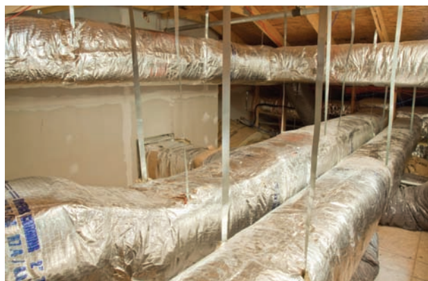
Figure 5: Cottage 6B, Glass Fiber Insulated Sheet Metal Ductwork Installation

Finally, because the buildings and the ductwork installations are a long-term investment for Luther Home of Mercy, financing and project life were set at 30 years.