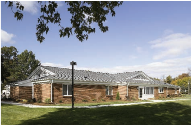
Figure 2: Cottage 6A, Luther Home of Mercy

Kingspan Insulation Ltd, in conjunction with CCS, commissioned MDA Engineering Inc. 8 , the project's HVAC system designers, to undertake an independent study of both installations, to compare air leakage, energy use, associated CO 2 emissions and installed, operational and whole life costs.