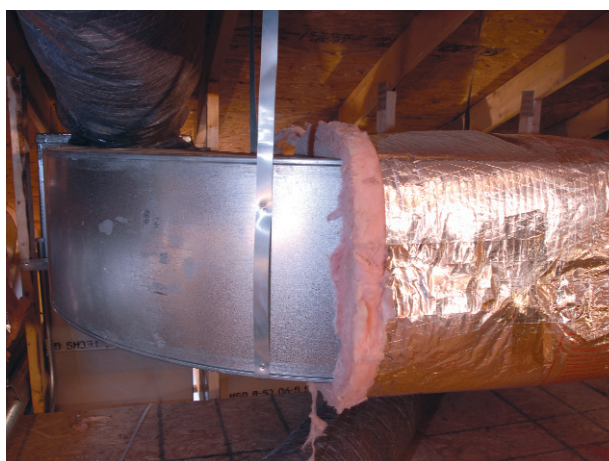
Figure 6: Sheet metal ductwork requires a separate manual wrapping operation

The lower capital cost results primarily from the lower labor cost associated with the Kingspan KoolDuct ® System, largely a result of the increased speed with which it can be installed. This is a result of the fact that the Kingspan KoolDuct ® System is a single fix installation, and eliminates the separate manual process of wrapping the insulation around the ductwork.