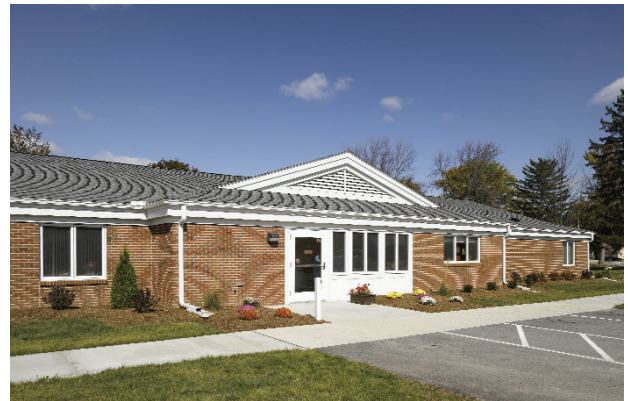
Figure 3: Cottage 6B, Luther Home of Mercy